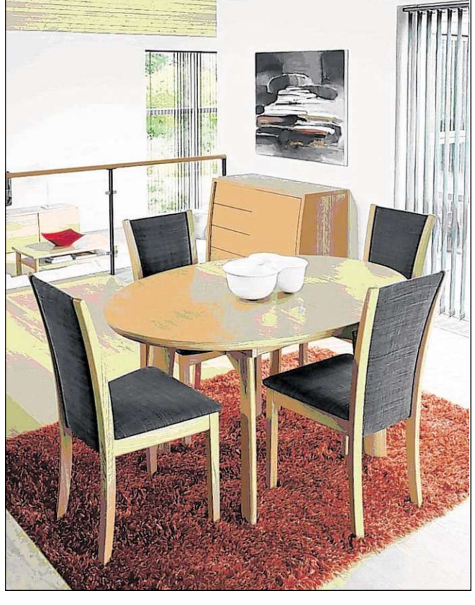
Table for six in Stillorgan

These offers – which do not include additional appliances - run to the end of December. There are also a number of ex-showroom appliances by Neff, Gaggenau and others for sale at 50 per cent off the retail price.